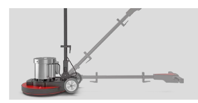
Ergonomically adjustable handle