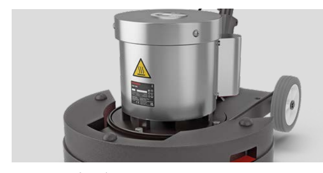
Maintenance-free planetary gear