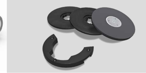
Wide range of accessories