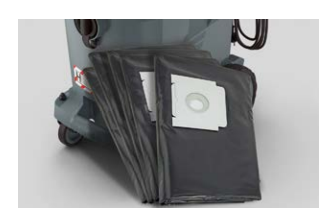
Dust Class H with additional "Asbestos" Certification